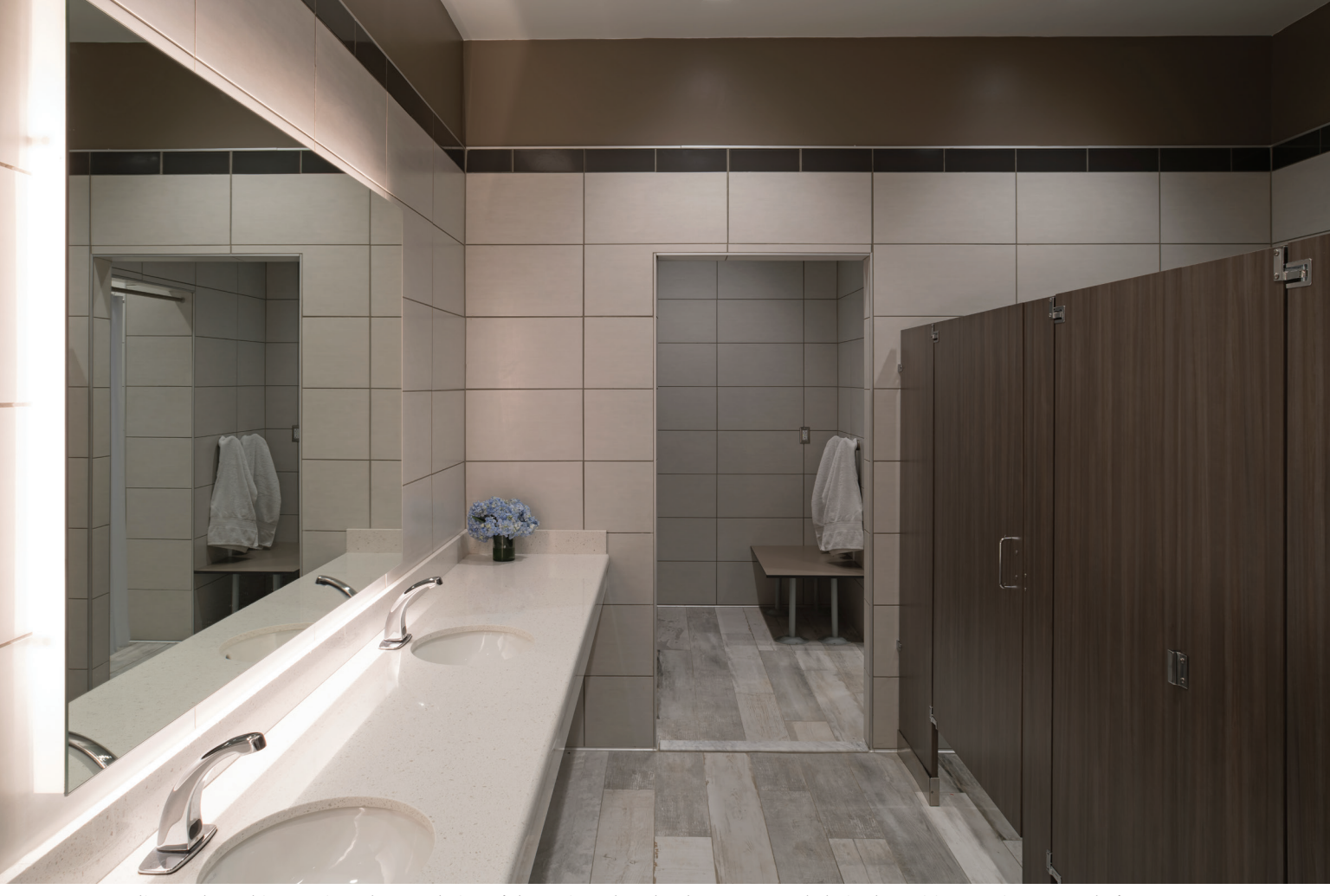
According to the architect, "Since the completion of the project, there has been an overwhelmingly positive reaction. Not only from Bexar County Public Works staff who are enjoying their new modern, and highly-functional space, but also from the public as the Bexar County Public Works building has increased visibility of the Mission Reach sector of the River and the communities/businesses that reside along it."

building as a perforated screen that is illuminated at night. The abstracted map is also featured as a wall mural in the lobby, as adhesive decoration on conference room windows and through the use of carpet tiles."