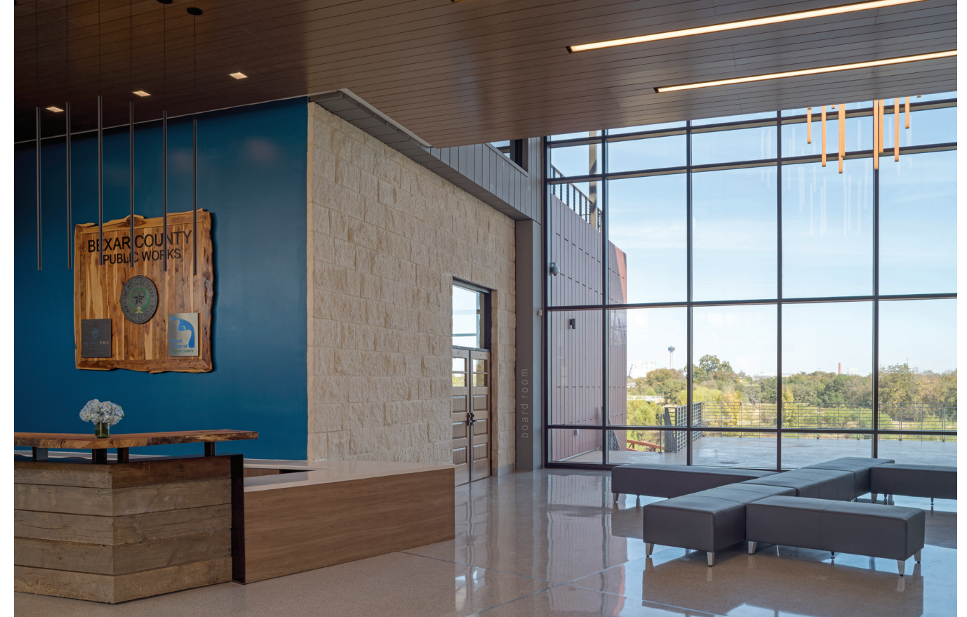
Mesa Grande Quarried Limestone Landscape Retaining Blocks – measuring 2 feet high x 2 feet wide x 4 feet long were used to tier down the slope and to enhance the illusion of the building growing out of the embankment.

One of the most challenging aspects of the stonework was determining the correct percentages of color range. "It was difficult to make sure we had the right mix of yellow stone to keep a random, but consistent mix of color," explained Garcia.