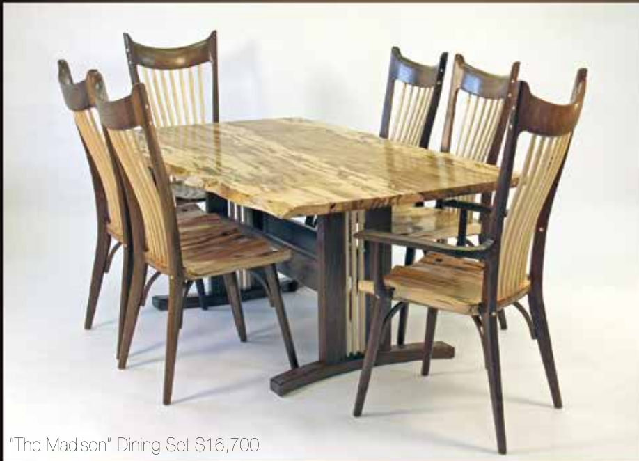
"The Madison" Dining Set $16,700