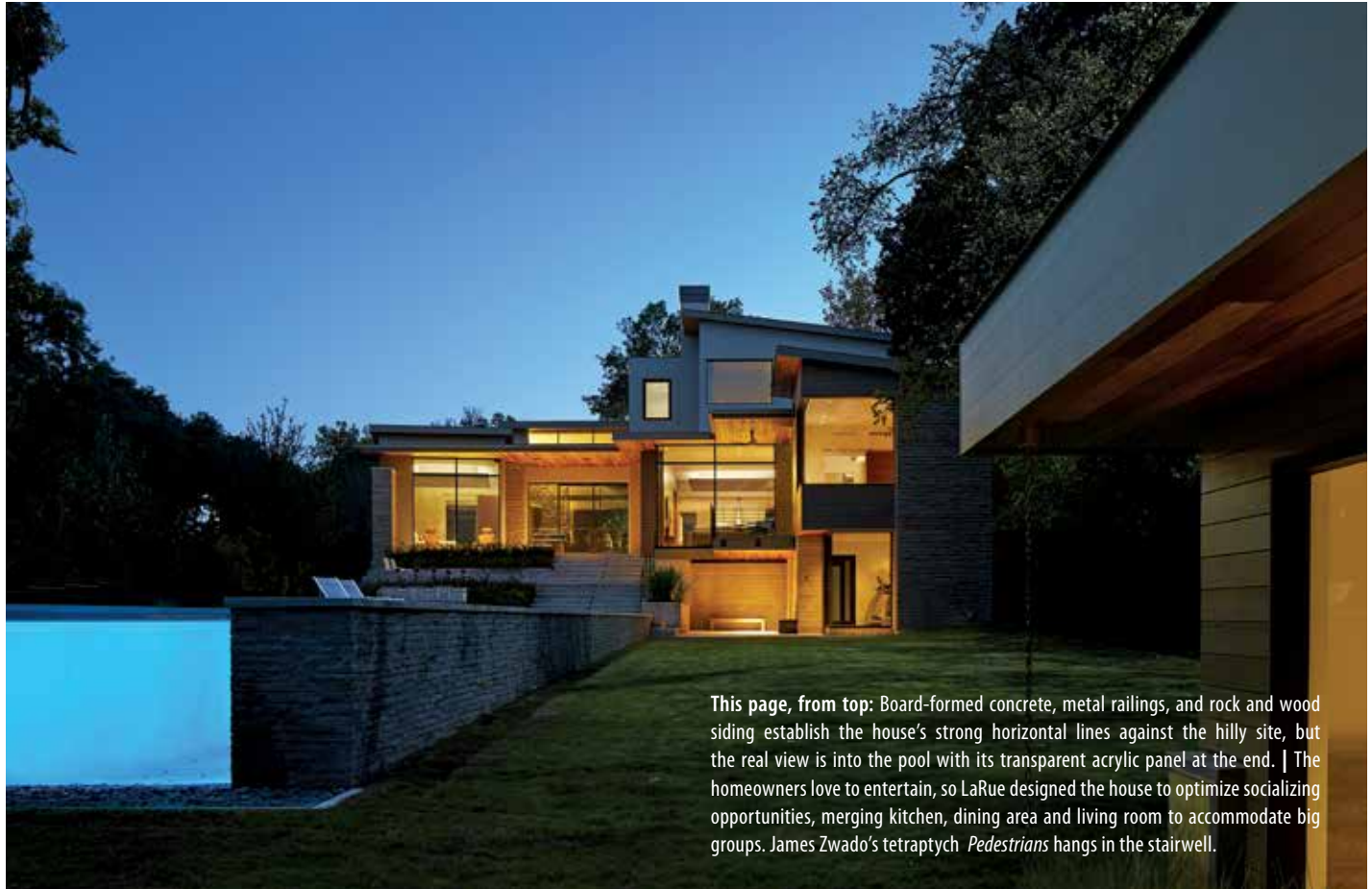
This page, from top: Board-formed concrete, metal railings, and rock and wood siding establish the house's strong horizontal lines against the hilly site, but the real view is into the pool with its transparent acrylic panel at the end. | The homeowners love to entertain, so LaRue designed the house to optimize socializing opportunities, merging kitchen, dining area and living room to accommodate big groups. James Zwado's tetraptych Pedestrians hangs in the stairwell.

a central dogtrot extends from one courtyard to another, LaRue's remedy for adjacent bad views.