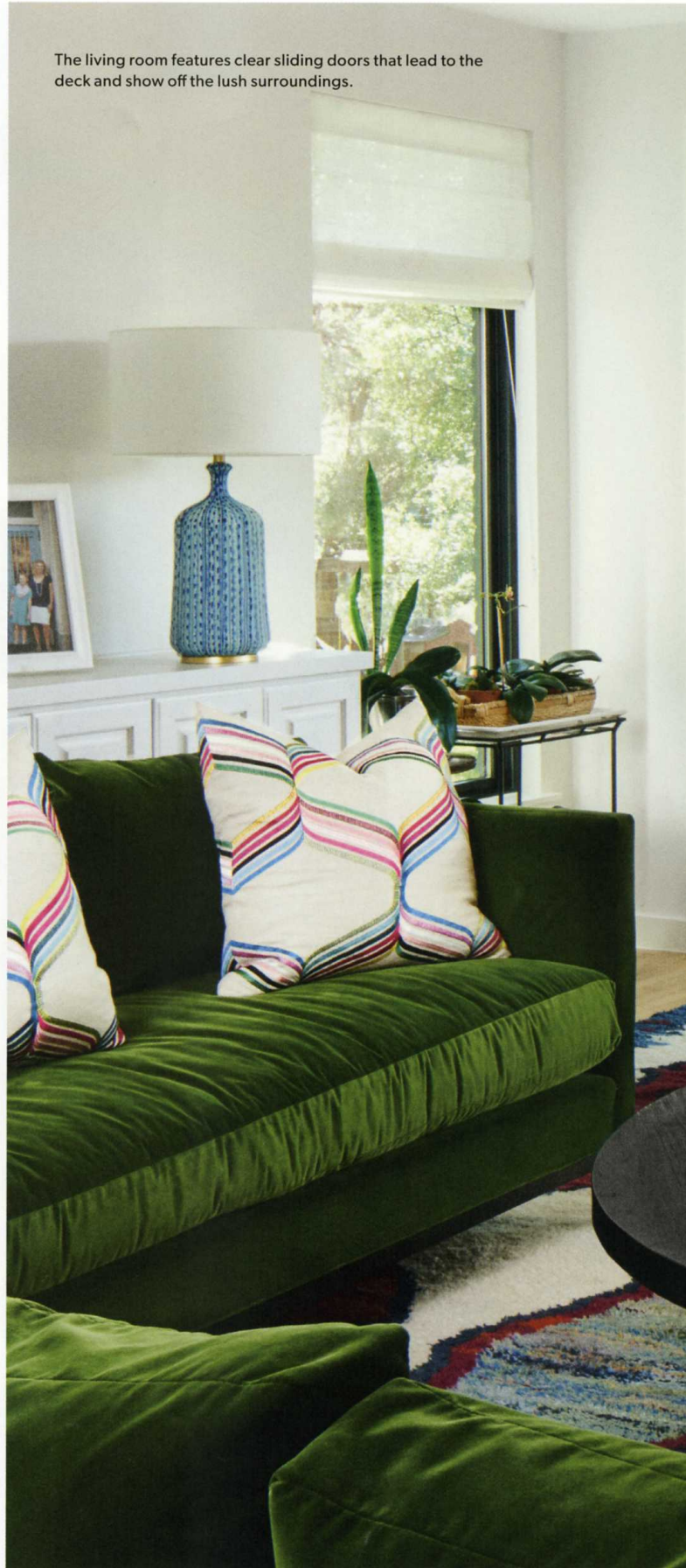
The living room features clear sliding doors that lead to the deck and show off the lush surroundings.

Kett and her crew gutted the interior of the house, leaving untouched only the existing wood floor, front door, stairs, and the living room (including a stone fireplace that was plastered over). On the first floor, the original kitchen was moved, creating an open concept with the kitchen, living, and dining rooms. ("I never would have thought to move the kitchen!" Megan says.) A new guest bedroom and bathroom filled the spot where the kitchen had been, while a long hallway connected a new, larger laundry room, a mud room, and the garage.