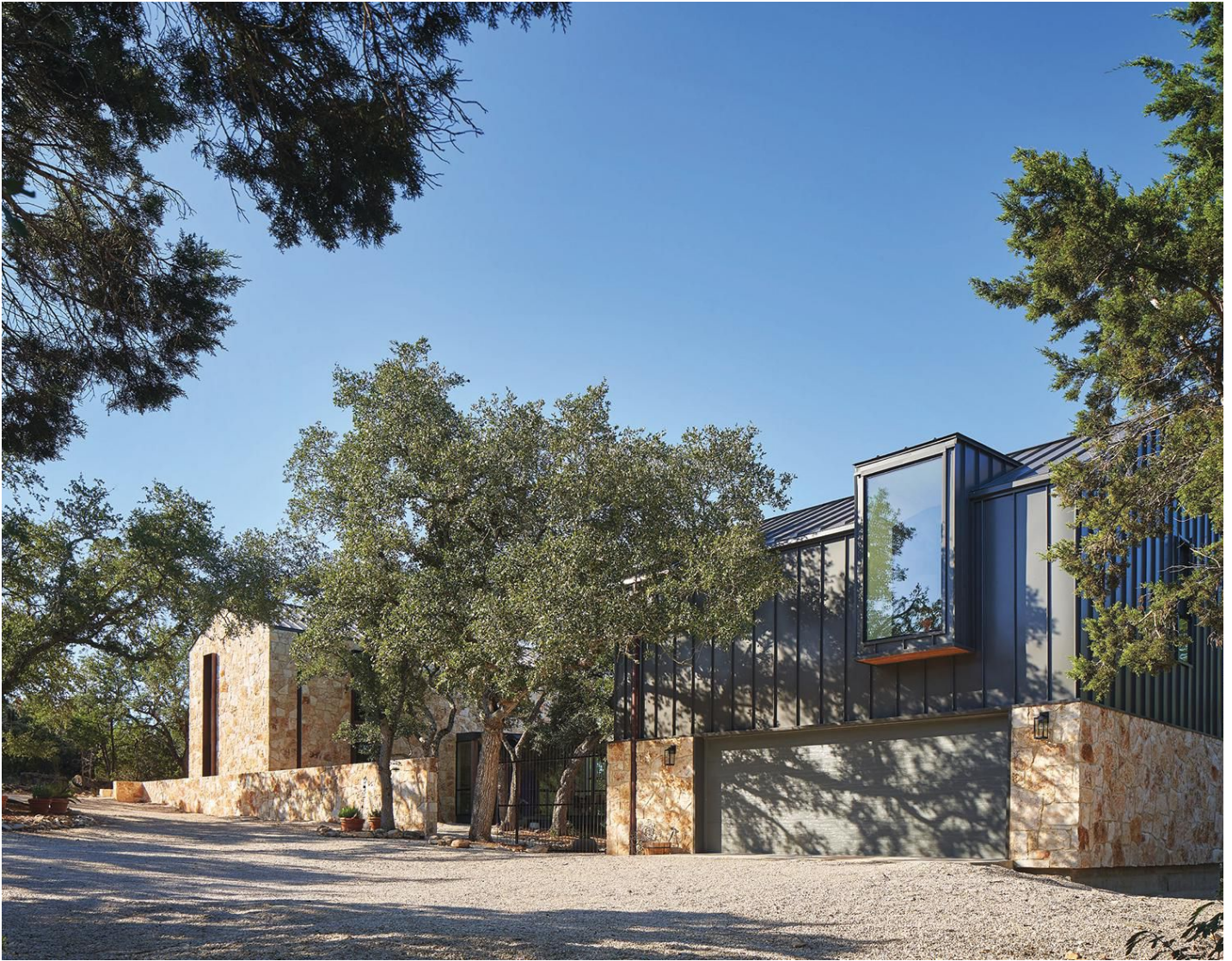
There are three main components to the residence: the “living house,” master suite and garage.

build with the stone as a veneer, rather than solid walls,” the architect went on to say. “So as not to create a false sense of history, we chose to detail the stone in a few key places to illustrate that it is a veneer. [Therefore], at once, the assemblage of three buildings, the ‘living house,’ the master suite and the garage are almost seen as ruins of old barns and buildings that have always been here. Yet upon closer inspection, you can see the stone is cantilevered from the slab, revealing that it is a skin, rather than structure. The continuity of the stone surface is