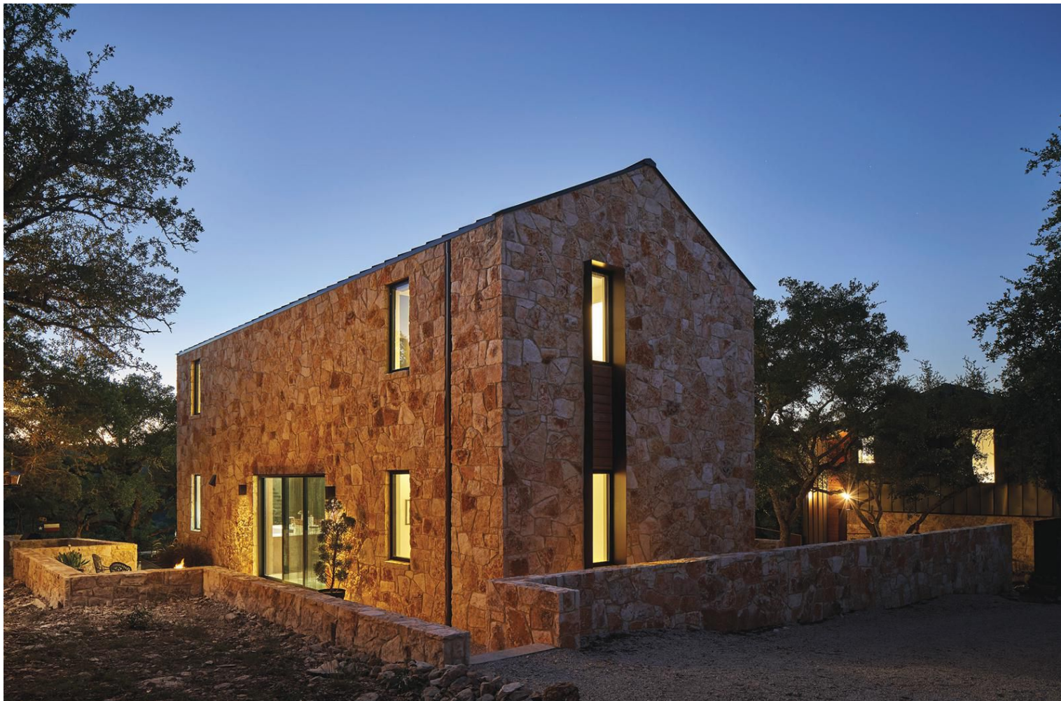
The chosen stone is "Country Blend" limestone, which was quarried by Cobra Stone based in Florence, TX.

D esigned by A.GRUPPO Architects of San Marcos, TX, a 3,300-square-foot private residence seated on a bluff 100 feet above the Blanco River in the Hill Country of Austin, TX, offers its occupants incredible views to the southwest. Pulling from its natural habitat, the residence is built of local Texas limestone and takes full advantage of surrounding trees to create an inspiring and serene living space.