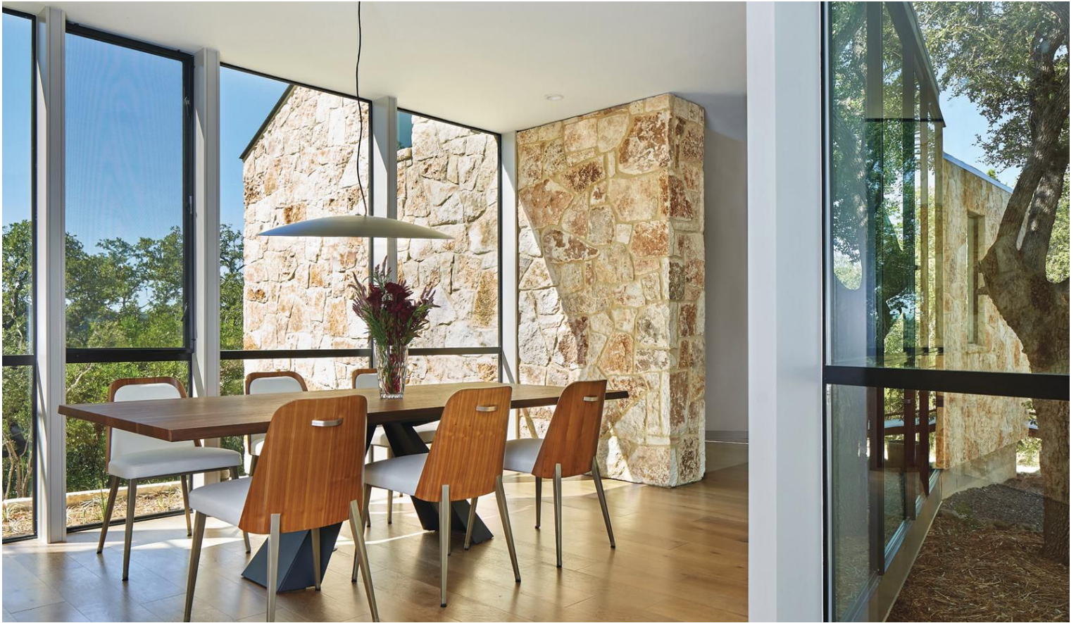
The use of limestone was carried into the interior design with a wall that can be seen on both sides of the glass window – merging a contemporary vibe with Old World charm.

the property, so we felt it was an honest representation of the place. This type of stone provided a wonderful counterpoint to the rectilinear steel and glass of the dining room and overall forms of the buildings.”