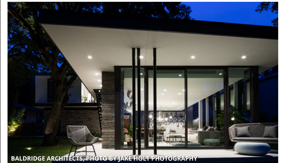
BALDRIDGE ARCHITECTS