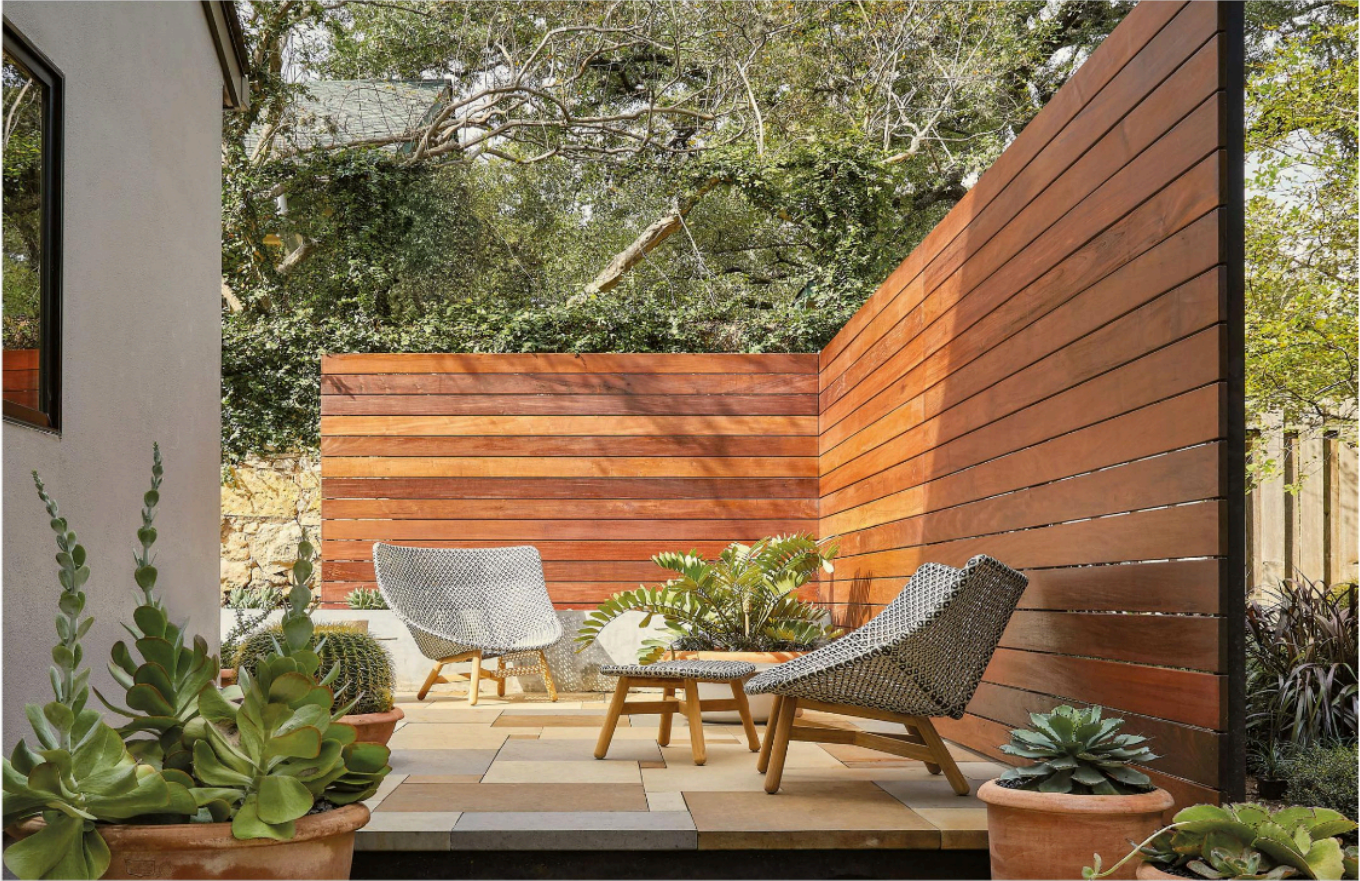
In the back of the house, landscape designer Bill Roberts of 3 Phase Design Studio created an outdoor living area marked by an ice wood wall. A pair of chairs and a footstool from Dedon's Morace collection sit atop McGonigle limestone paving.