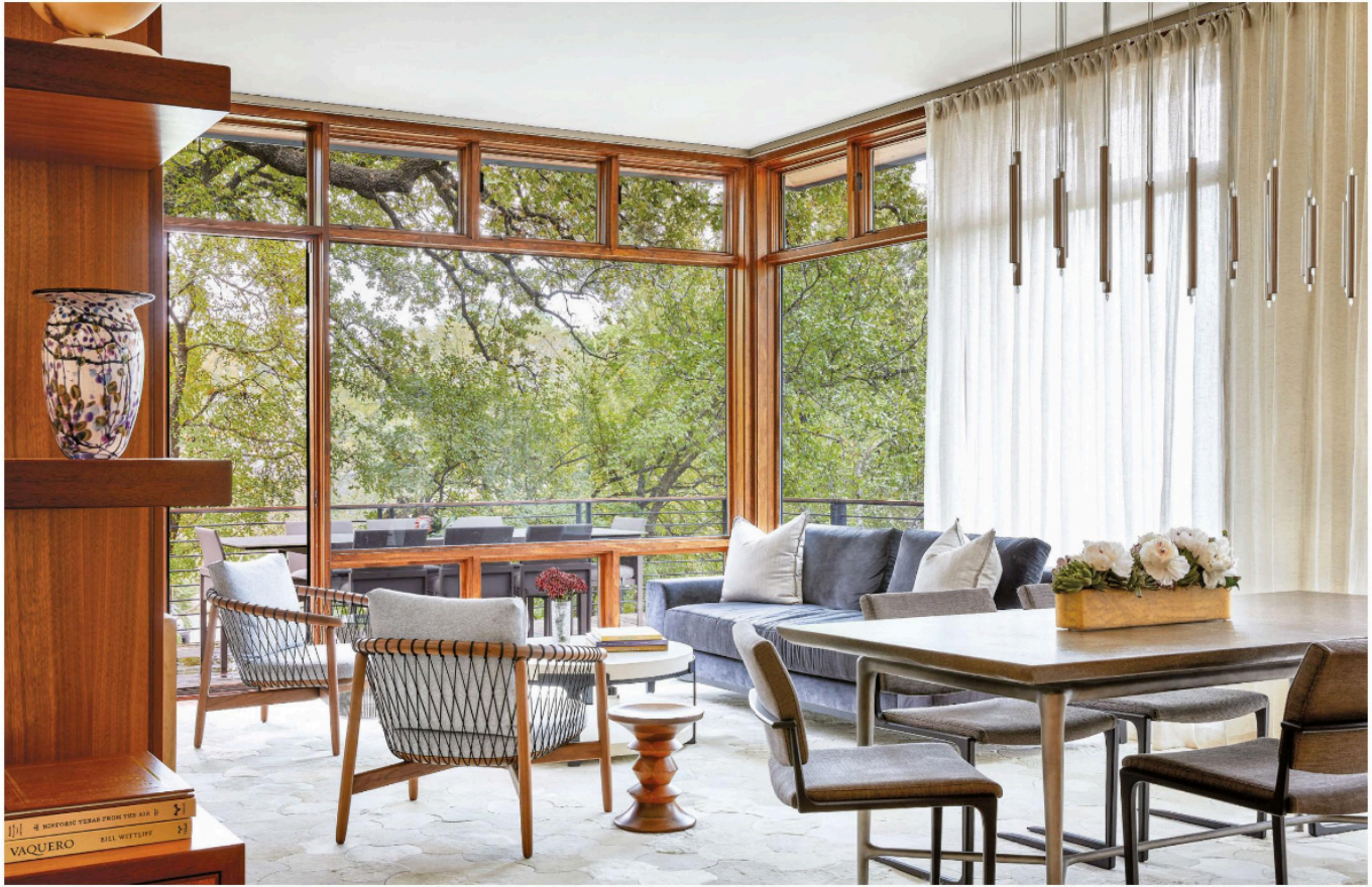
D'Nova Design fabricated draperies using Holly Hunt Great Plains sheer linen to soften the natural light streaming into the living room. A Holly Hunt cocktail table and sofa—white holds throw pillows D'Nova Design created with Hermès fabric from George Camargo. Nash—beam with a Hammer Mill Eames walnut stool and walnut lounge chairs from Design Within Reach. The rug is Kyle Burting.